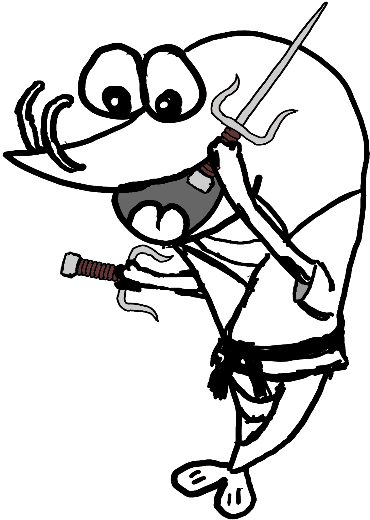
Ebisan using Sai